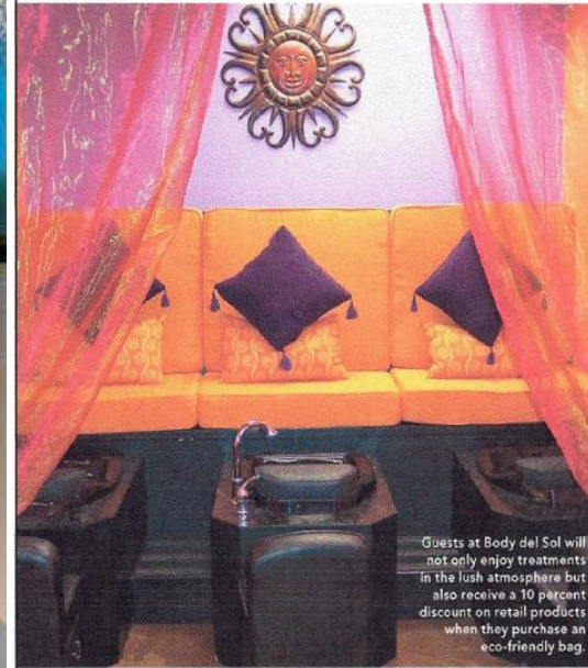
Guests at Body del Sol will not only enjoy treatments in the lush atmosphere but also receive a 10 percent discount on retail products when they purchase an eco-friendly bag.